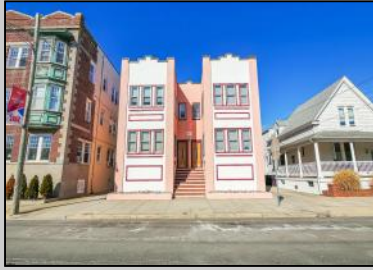
6211 Ventnor #300 Ventnor, NJ 08406