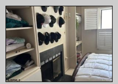
550 Central Linwood, NJ 08221