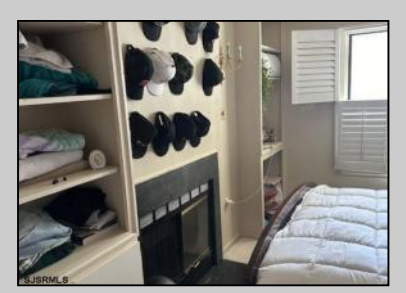
550 Central Linwood, NJ 08221