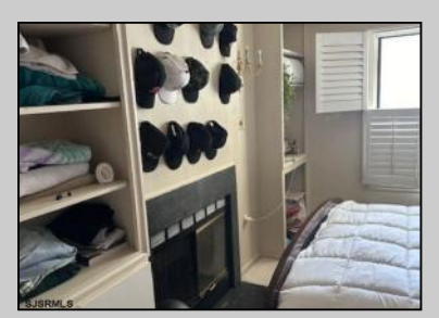
550 Central Linwood, NJ 08221