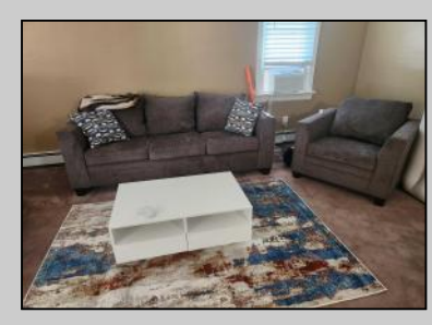
2018 Magellan Atlantic City, NJ 08401