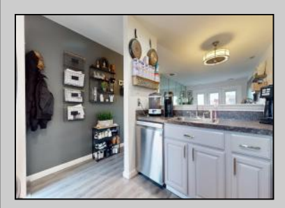
1163 Radio Rd # 8 Little Egg Harbor, NJ 08087