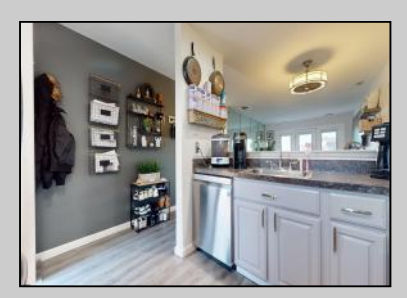
1163 Radio Rd # 8 Little Egg Harbor, NJ 08087