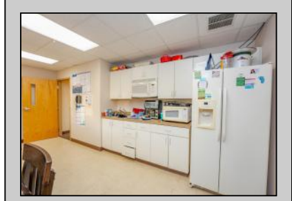
1206 Sherman Vineland, NJ 08360