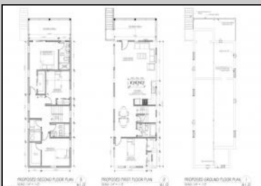
PROPOSED FIRST FLOOR PLAN PROPOSED SECOND FLOOR PLAN PROPOSED OUTDOOR DECK PLAN