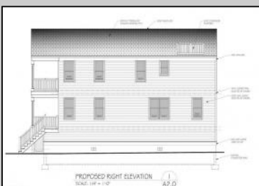
PROPOSED RIGHT ELEVATION SCALE: 1/4" = 1'-0"