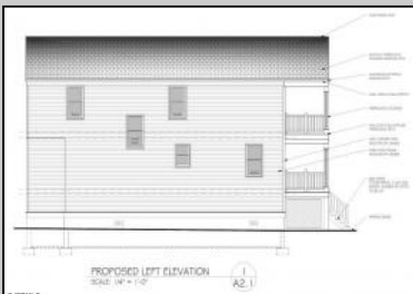
PROPOSED LEFT ELEVATION SCALE: 1/4" = 1'-0"