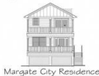
Margate City Residence

Addition/ Alterations to: 202 N Fredericksburg Ave Margate City, NJ 08402