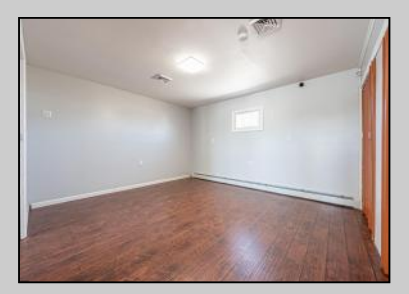
7057 Black Horse Pike Egg Harbor Township, NJ 08234