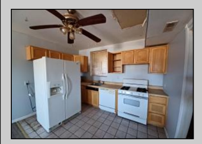
715 Harris Atlantic City, NJ 08401