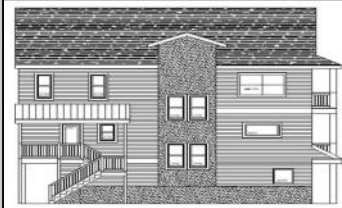
Left Side Elevation Scale 1/4" = 1'-0"