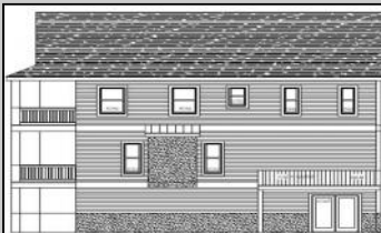
Right Side Elevation Scale 1/4" = 1'-0"