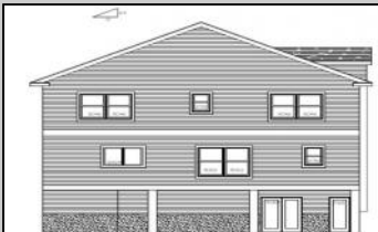
Front Elevation Scale 1/4" = 1'-0"