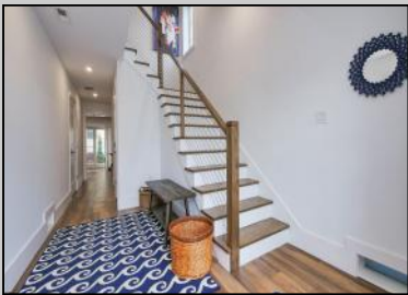
10 Knight Margate, NJ 08402