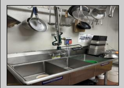
709 Route 9 S Cape May Court House, NJ 08210