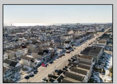
325 west Ocean City, NJ 08226