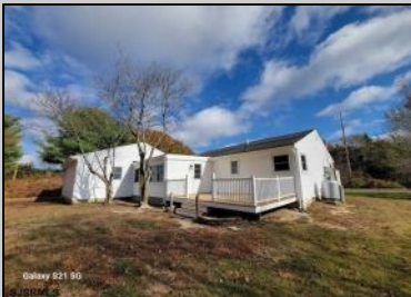
Galaxy S21 5G