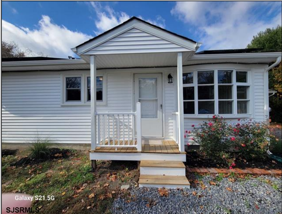
Galaxy S21 5G