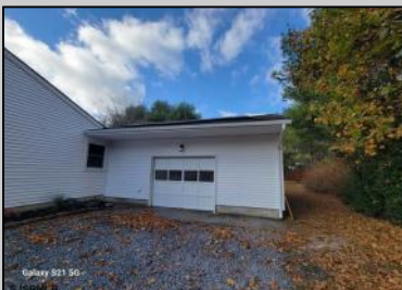
Galaxy S21 5G