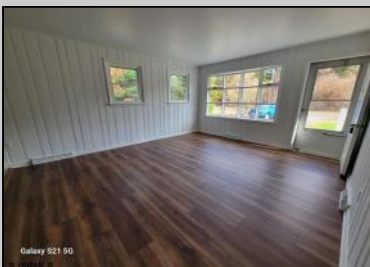
Galaxy S21 5G