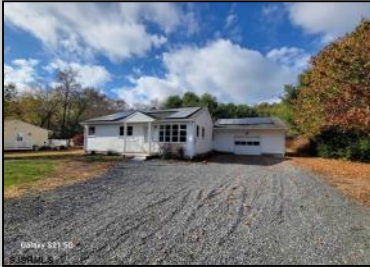
Galaxy S21 5G