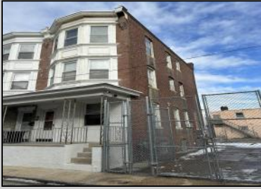
37 Spray Ave Atlantic City, NJ 08401