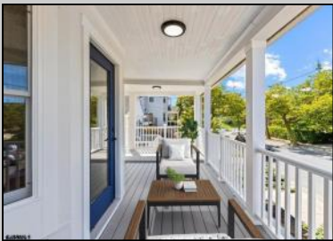
3 Surrey Ventnor, NJ 08406