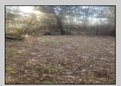
124 Church Egg Harbor Township, NJ 08234