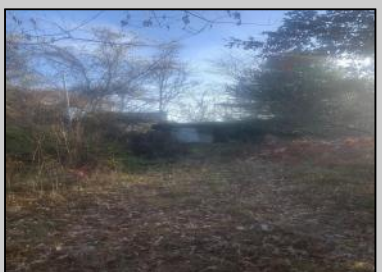
124 Church Egg Harbor Township, NJ 08234