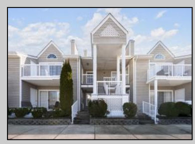
550 Central Ave Linwood, NJ 08221