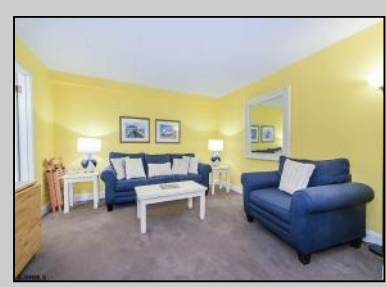
812 Ocean Ocean City, NJ 08226