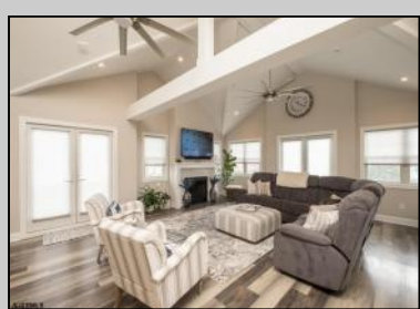
1000 Asbury Ocean City, NJ 08226