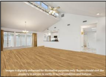
Images is digitally enhanced for illustrative purposes only. Buyers should visit the property in person to verify its actual condition and features