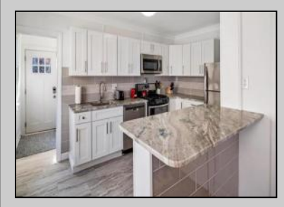
126 Portland Ave Ventnor, NJ 08406