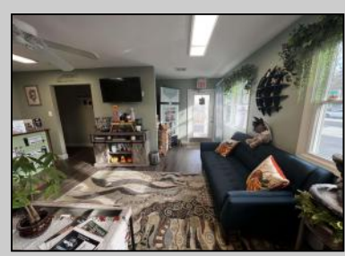
803 New Road Somers Point, NJ 08244