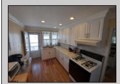
3303 Asbury Ave Ocean City, NJ 08226