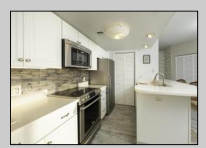
3851 Boardwalk Atlantic City, NJ 08401