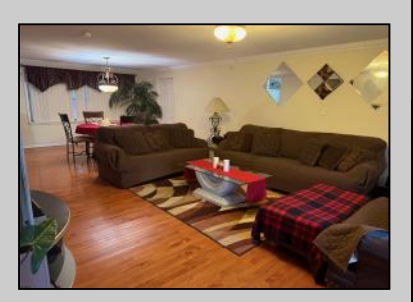
319 Jays Williamstown, NJ 08094