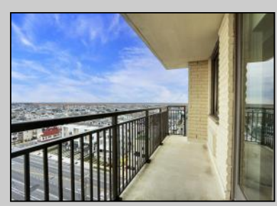
9600 Atlantic Ave Margate, NJ 08402