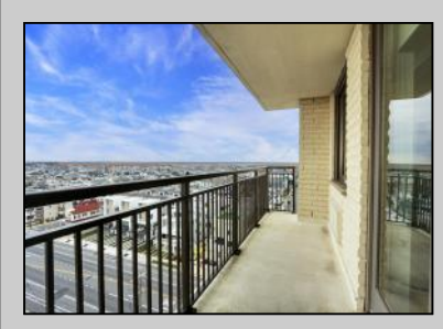
9600 Atlantic Ave Margate, NJ 08402