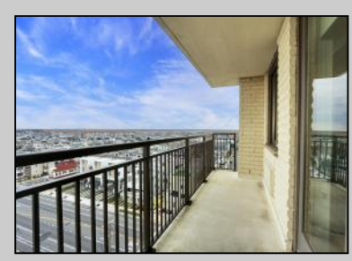
9600 Atlantic Ave Margate, NJ 08402