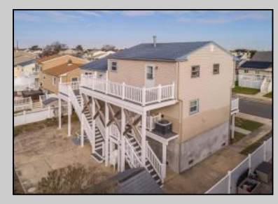
604 Cambridge Ventnor Heights, NJ 08406