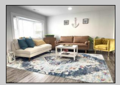
1530 Beach Ave Atlantic City, NJ 08401