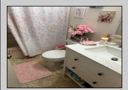
28 Liberty Court Galloway Township, NJ 08205