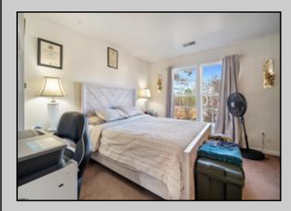
72 Jamestown Mays Landing, NJ 08330