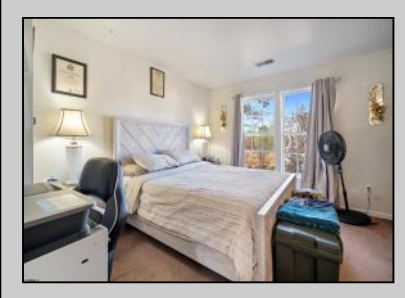
72 Jamestown Mays Landing, NJ 08330