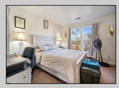
72 Jamestown Mays Landing, NJ 08330