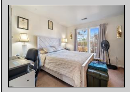
72 Jamestown Mays Landing, NJ 08330