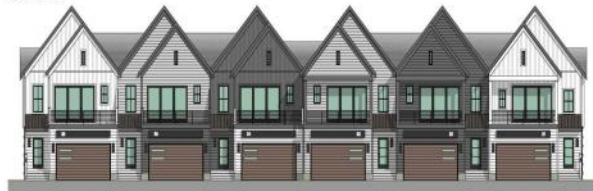
EAST FRONT ELEV