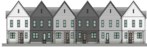
EAST REAR ELEV