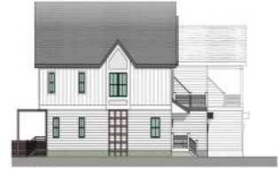
EAST LEFT ELEV