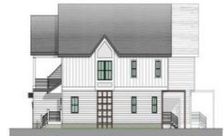
EAST RIGHT ELEV