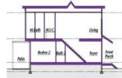
SECTION @ FOYER