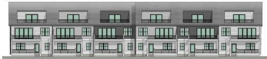
BUSINESS FR ELEV