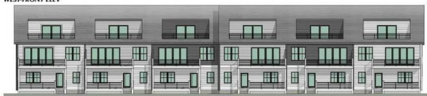
BUSINESS FR ELEV