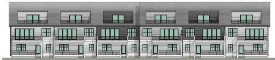
BUSINESS FR ELEV