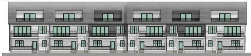
BUSINESS FR ELEV