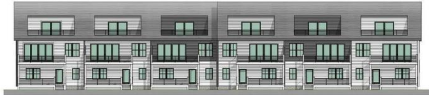
BUSINESS FR ELEV