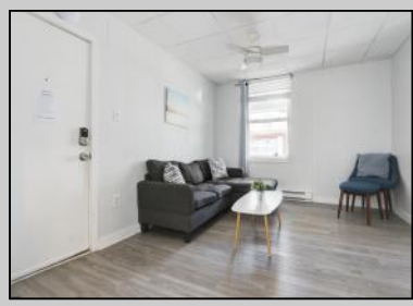
106 Little Rock Ventnor, NJ 08406