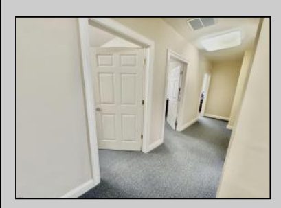
1800 New Road Northfield, NJ 08225