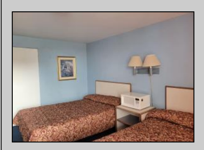
7080 Black Horse Pleasantville, NJ 08232